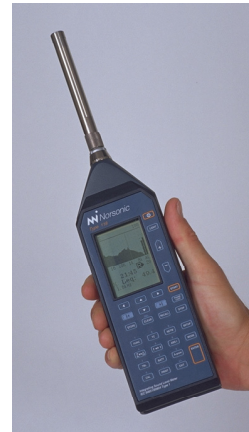
Figure 2: The STIPA method is implemented as a program option in the sound level meter Norsonic Nor118. Both STI- and CIS-value are presented, without and with a virtual background noise level.