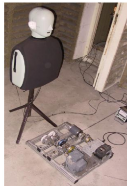
Figure 1: Acoustic dummy head placed near the test bench in order to record the 18 samples according to the experiment table.

The task of the listeners was to evaluate the dissimilarity between each sound and a reference one, for which the 6 controlled factors were left at level 1, corresponding to the nominal state of the bench. 30 listeners were involved in this test.