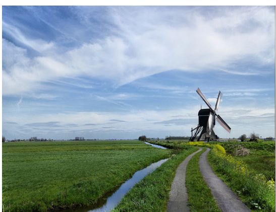
Figure 2: Study area Alblasserwaard