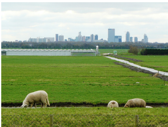
Figure 1: Study area Midden-Delfland