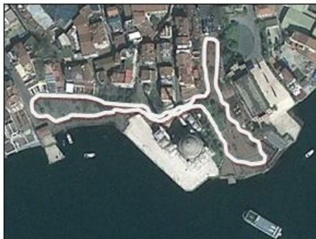
Ortaköy Pier Square