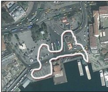
Beşiktaş Pier Square

Binaural recordings and measurements of overall sound levels are simultaneously obtained. In the walks which lasted approximately 15 min., the routes for soundwalks are determined in order to have a general opinion about the sound environments of the selected areas, by considering how citizens act in these areas in their daily life (Figure 2).